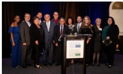
19th Annual For the Public Good Gala fundraiser.